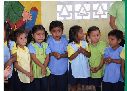
Early childhood education center in Quito, Ecuador

DSP operates with 93 partner organizations in: Argentina, Brazil, Chile, Colombia, Ecuador, Haiti, Mexico, Paraguay, Peru, and Venezuela.