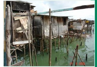
Upgrading and Family Relocation in Alagados, Brazil

The relationships AVSI has built with the communities in Brazil set the stage for partnerships with local energy companies, who otherwise had difficulty reaching consumers to provide basic services efficiently. This collaboration has led to other integrated social interventions and upgrading.