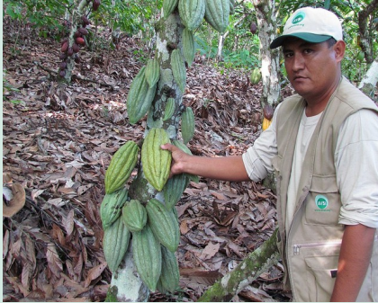
Cocoa growth in Bagua Province, Peru

Projects in Argentina, Brazil, Haiti and Peru