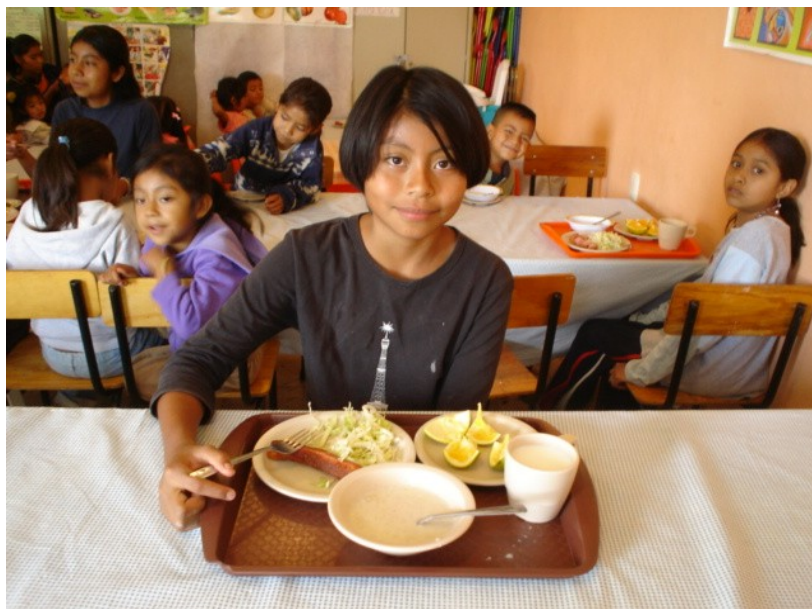
Breakfast at the DIJO-Crecemos community kitchen in Oaxaca, Mexico

In Haiti , eight emergency nutrition centers were set up in some of the most depressed areas of Port-au-Prince, specifically in Cité Soliel, to help those displaced after the earthquake. Now they have become permanent and irreplaceable for the services they provide to the neighborhoods, and have extended to also offer integrated child health care and pre- and post-natal care including breast-feeding classes for mothers.