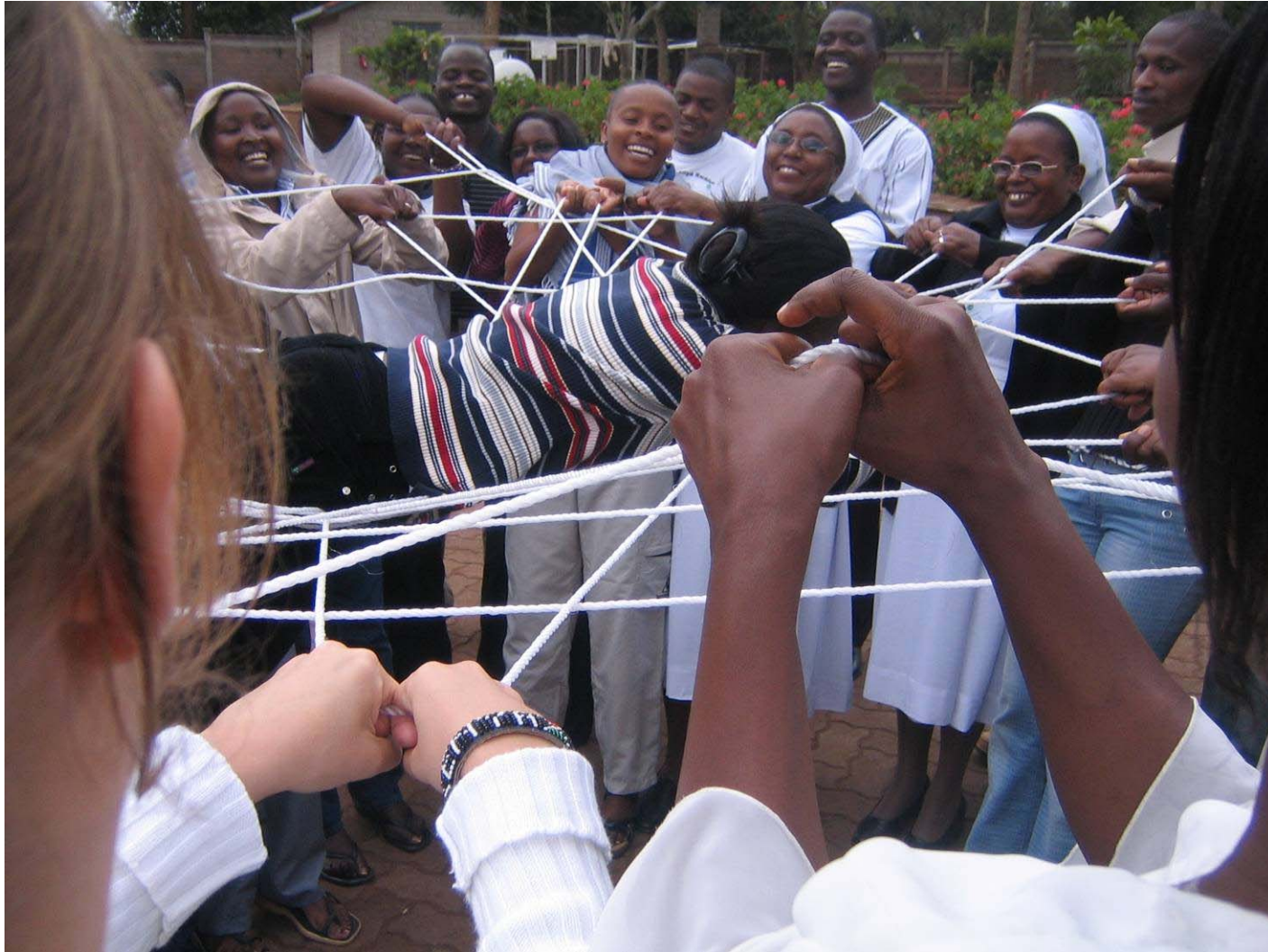
The spider web